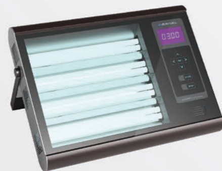
KN-4006AL 2 /BL 2