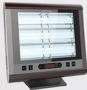
KN-4006A 1 /B 1