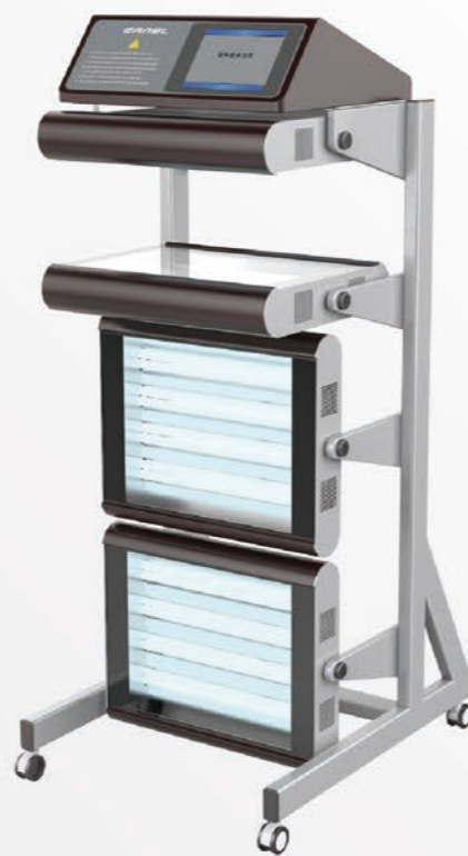
KN-4006AL 3 /BL 3

KN-4006A 1 /B 1 : 400mm×84mm×340mm (L×W×H) KN-4006AL 2 /BL 2 : 420mm×558mm×86mm (L×W×H)